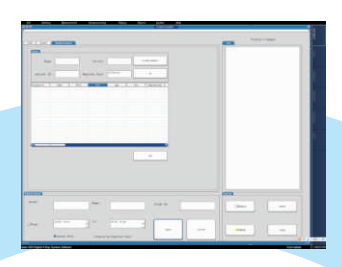
Worklist registration interface: Seamless connection to PACS, HIS and RIS systems