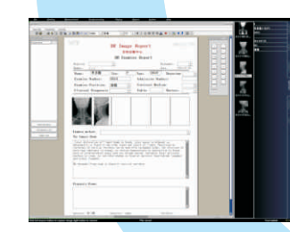
Report interface: More than 200 report templates included to facilitate the users