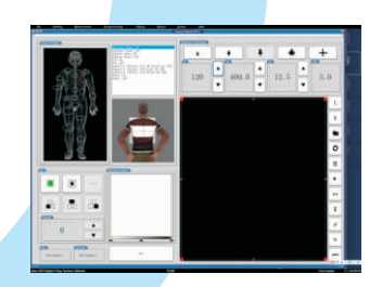
Acquisition interface: There are more than 100 scanning protocols for corresponding parts, and It gives the corresponding positioning indication diagram. Definitely, users can define their own dedicated protocols according to the situations