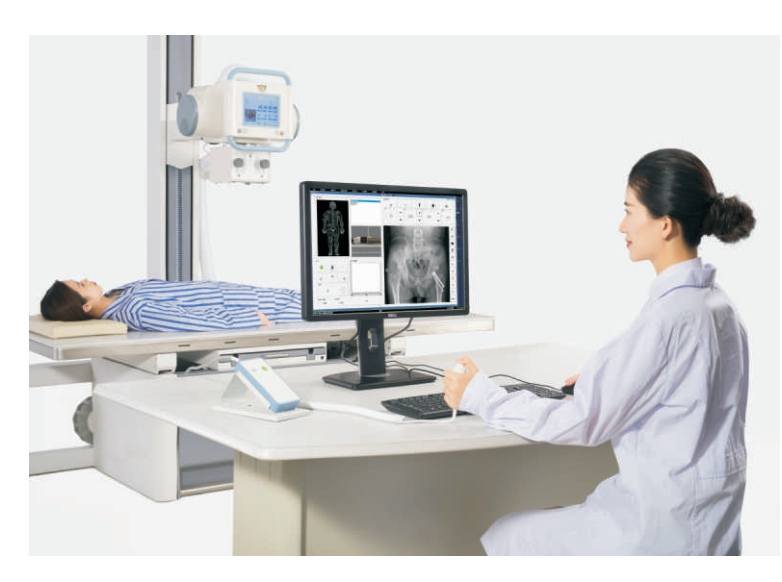
Integrated powerful workstation, friendly interface and streamlined workflow provide convenient and efficient operation