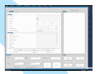
Patient registration interface: Well sorted and simple for registration