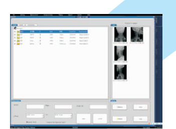
Patient library interface: Refreshing interface, easy to operate, convenient for doctors to find patient's information

Image acquisition and post-processing integrated workstation combined with registration, acquisition, storage, reporting, printing, transmission, query and other functions provides a friendly interactive user interface, user-friendly & simple operation process. In the meanwhile, It can fully meet the DICOM3.0 standards and achieve seamless connection to HIS/RIS/PACS systems